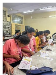
Seminar and paper modelling workshop on Human anatomy