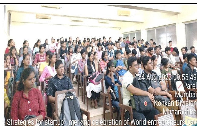
Students listening to the speaker