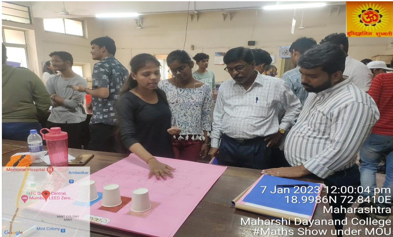
Judging of Maths Show