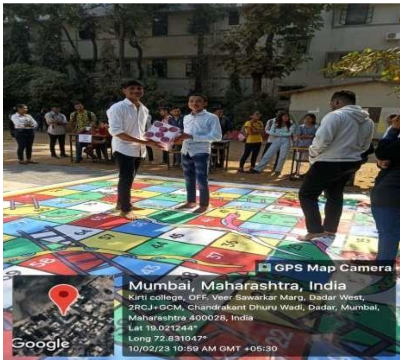
Mathematical Sapsidi( Snake & Ladder)