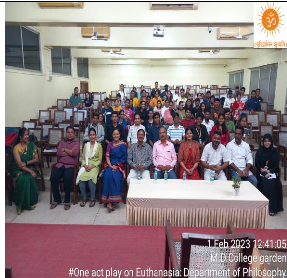
With the team of Euthanasia play along with students