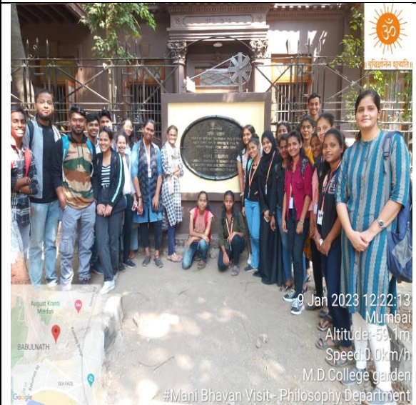
Educational visit to “Mani Bhavan”