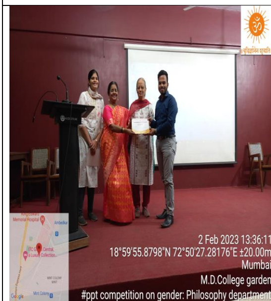
PPT Competition on Gender