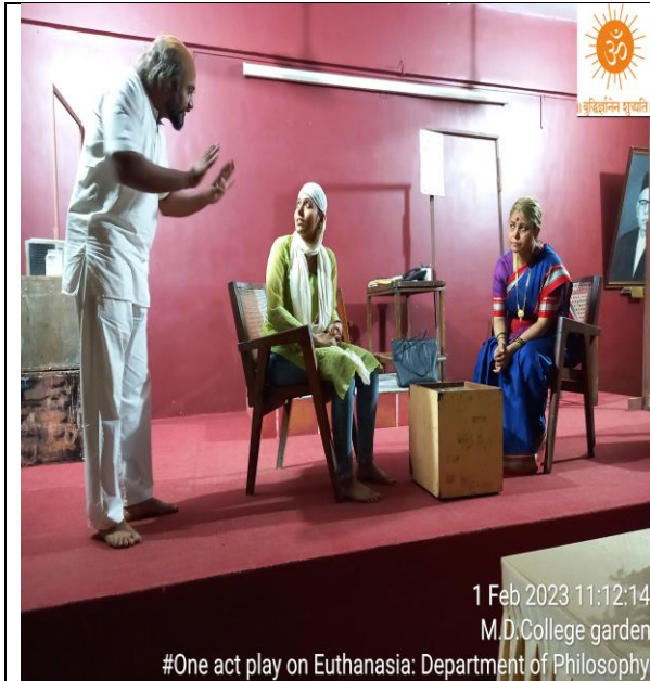
One act play on “Euthanasia”