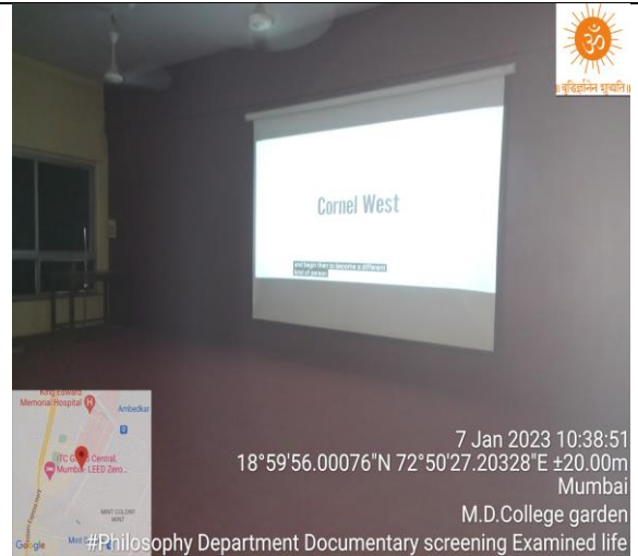
Documentary screening on “Examined life: Philosophy is on the streets”