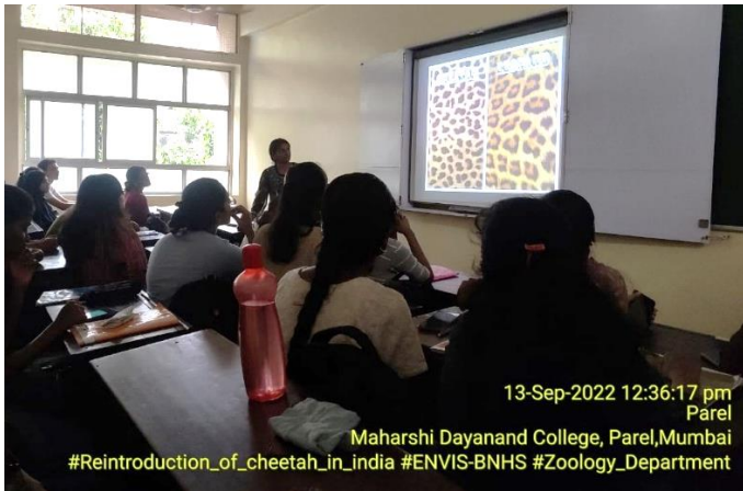
Sensitizing session on the theme of “Reintroduction of Cheetah in India”