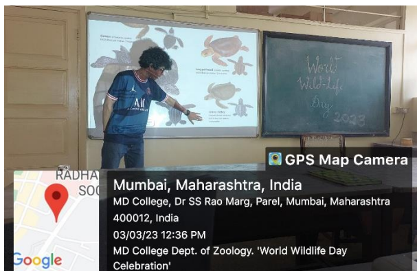
T.Y. B.Sc. Zoology- World WildLife Day