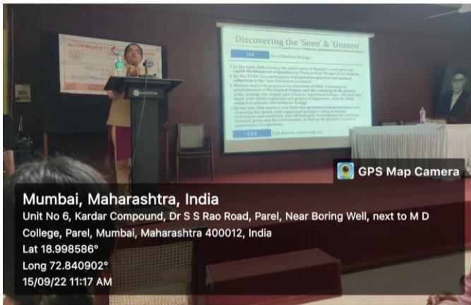
“Model Organisms: Unity in Diversity” in association with Indian Women Scientists Association, supported by BRNS-DAE