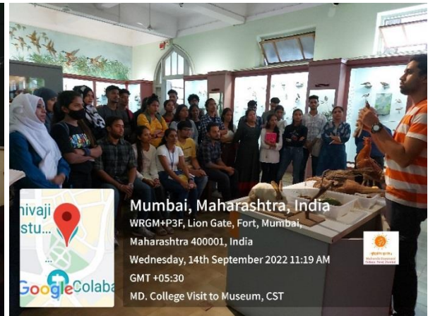
Visit to Chhatrapati Shivaji Maharaj Vastu Sangrahalaya