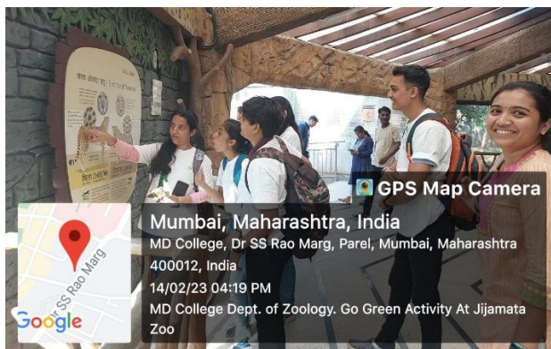
Students volunteered “Go Green activity” at Byculla Zoo.