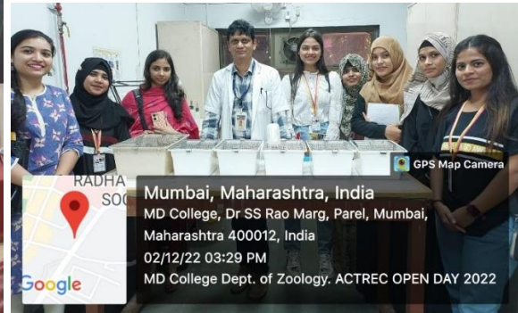
Institutional visit to ACTREC, Kharghar