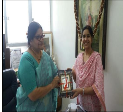
Appreciation by the Principal