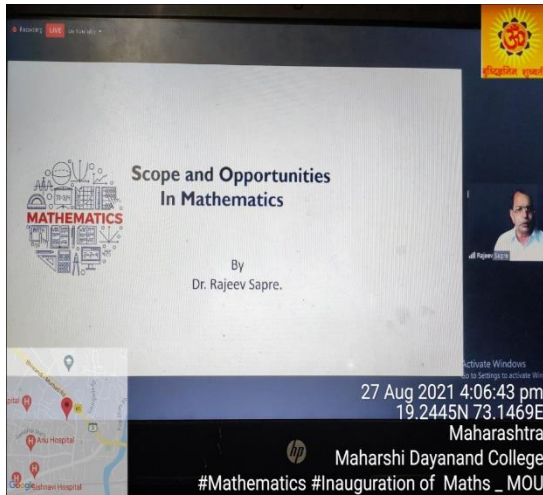
An online Inaugural Function - MATHS- MOU