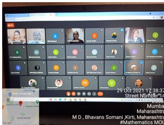
Closing Ceremony of Bridge Course