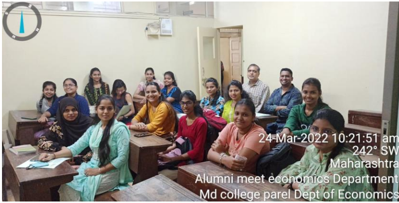
24-Mar-2022 10:21:51 am 242° SW Maharashtra Alumni meet economics Department Md college parel Dept of Economics