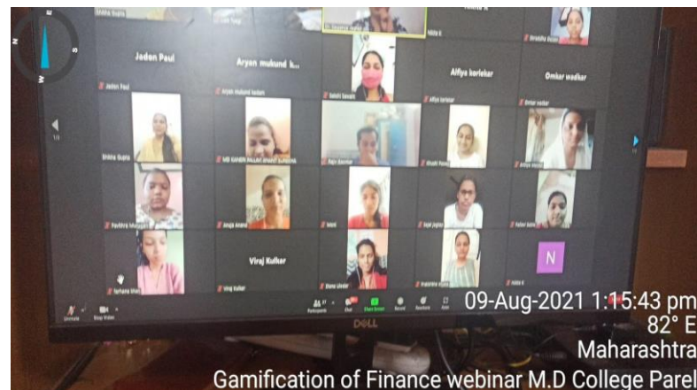
09-Aug-2021 1:15:43 pm 82° E Maharashtra Gamification of Finance webinar M.D College Parel