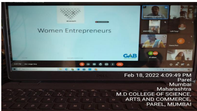
Feb 18, 2022 4:09:49 PM Parel Mumbai Maharashtra M.D COLLEGE OF SCIENCE, ARTS AND COMMERCE, PAREL, MUMBAI