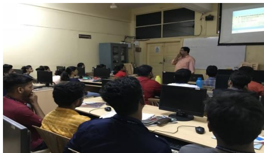
Resource person interacting with students