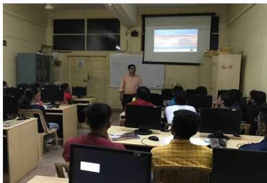
Resource person imparting knowledge