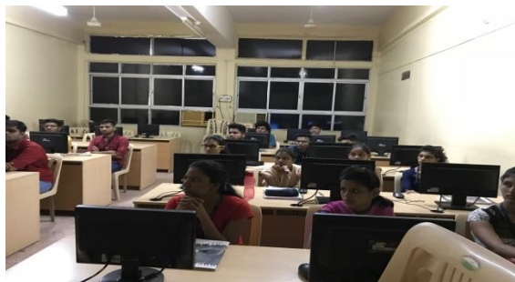
Students participating in the seminar