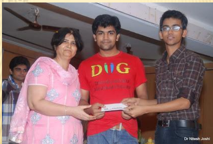
INTERCOLLEGIATE FLOWER ARRANGEMENT AT RIZVI COLLEGE