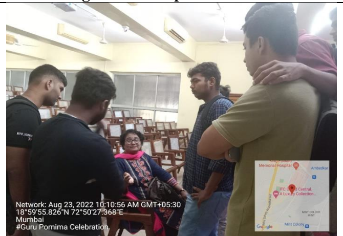
Students interacting with Guest Speaker