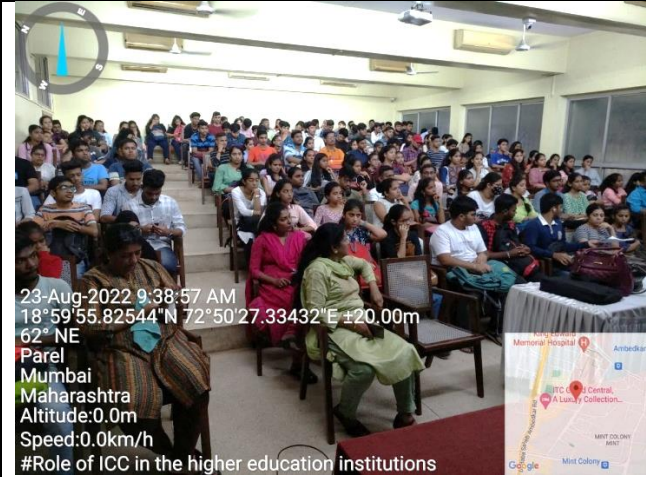
Students at ICC Guest lecture