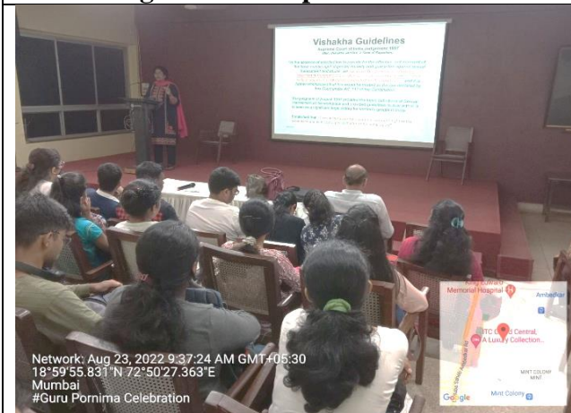
Guest Speaker conducting Session