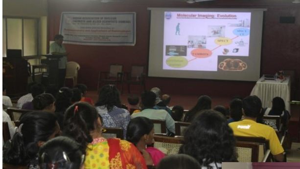
11 Scientist from BARC conducted workshop