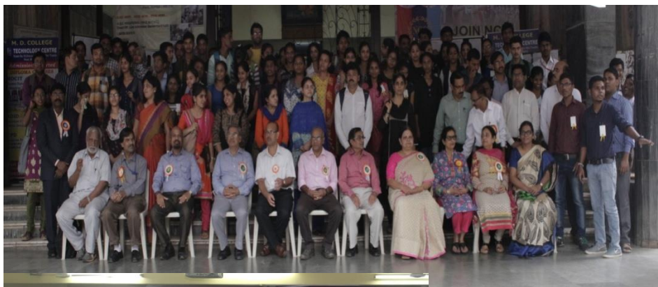
120 participants ( 25 Faculty members) of 14 colleges from Mumbai University